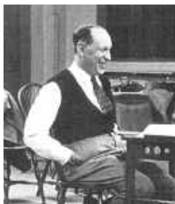
Harold Clurman Festival of The Arts at the Stella Adler School

takes a look at her own life in show business so far—that would be the tale of a small town girl making it in the big city, with Mom to thank, of course-- to the Laurie Beechman Theatre on 42nd